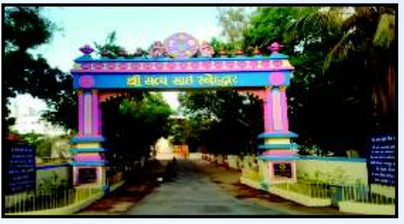
Sri Sathya Sai Sneh Dwar, Navsari