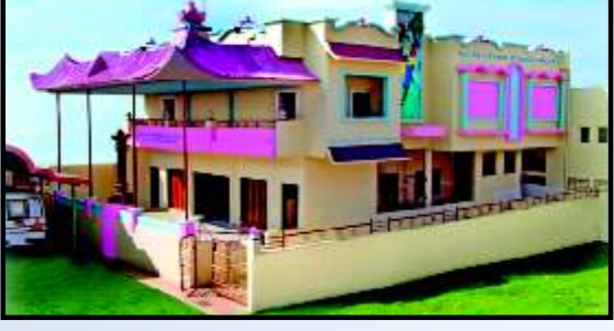
Sri Sai Avtar Pradarshini, Navsari