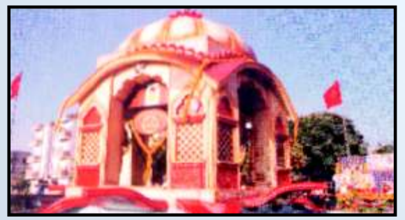
Sri Sathya Sai Circle, Vadodara